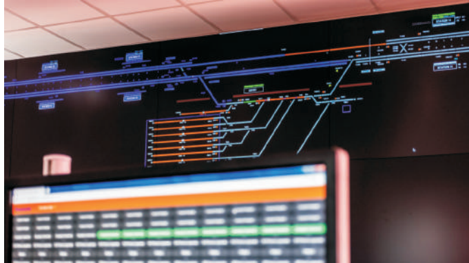
Fig. 3. Picture of the video wall for the train dispatcher for the first working section of line 3 (from Hadzhi Dimitar metro station to Krasno Selo metro station)