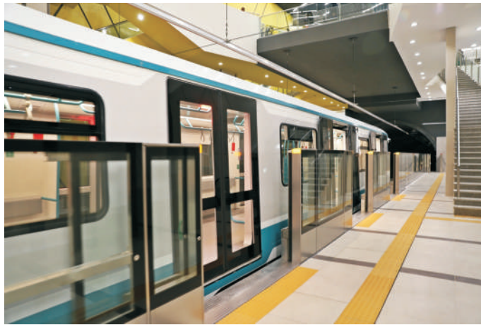
Fig. 6. Platform partition doors of metro station “NDK-2”

PPVs communicate directly with the IXL system. When a door is open or when there is no control of any of the 16 doors on the platform, a signal is sent to the Trackguard system, which in turn stops the trains approaching the station. PPVs are mandatory at automation level GoA4. This is one of the prerequisites for the third metro line in Sofia to be completely ready, as hardware, for the transition to the highest level of automation.