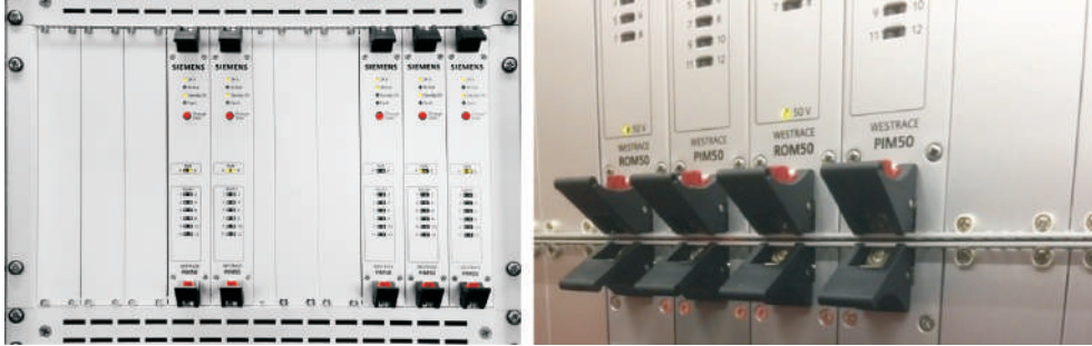
Fig. 1. Equipment of Trackguard Westrace Mk II