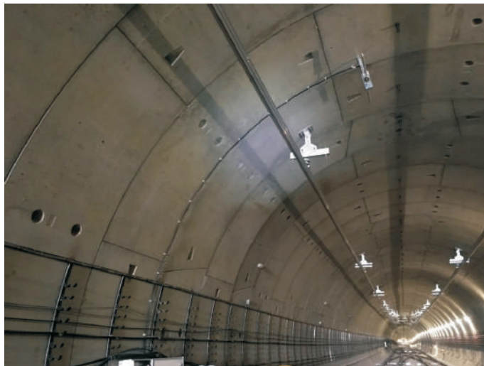
Fig. 5. Airlink system antenna

The data transmission system realizes the two-way continuous communication between the rolling stock and the road equipment. The system includes serially produced products and components customized to the specific requirements of the project. Airlink's modular design, combined with the use of standard telecommunications products, make the system easy to maintain and upgrade.